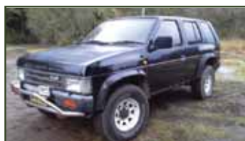
NISSAN TERRANO 1991 4wd, diesel 275ks great motor, gear box. Amazing tyres 9mths rego $4500 ono Ph 0434 490 239