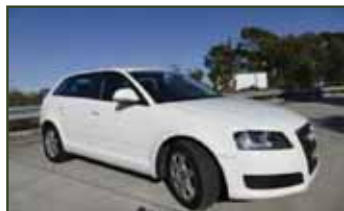
AUDI A3 1.4TFSI AUTO 2009 Excellent condition A3 Sportsback, Audi serviced 139,000Kms, full 12 mth rego, leather seats, parking sensors, $13,000 Call 0418 978 322