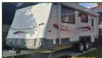
2012 AVON EUROSTAR CARAVAN Done 4 trips wash machine & many extras $48k ono Ph: 0411 756 745