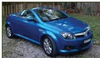
2006 1.8 XC MANUAL HARD TOP CONVERTIBLE HOLDEN TIGRA. Great fun, two seater, low mileage, rego to Feb 2016. $8,500 ono. 0407 733 881